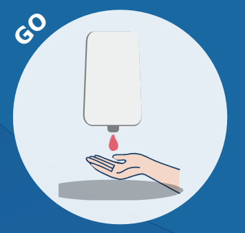
4. Ready to go!