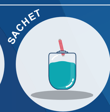
2. Drop the soap sachet into water