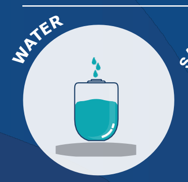
1. Fill the bottle with water to the line