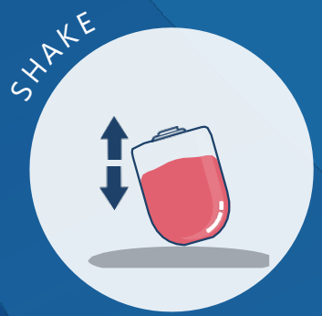
3. Shake the container. Wait 30 seconds